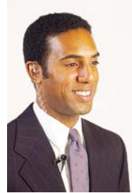
Acoustic Tube with Earphone

Optional Clear Comfortable Earpiece—Order Separately