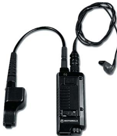
BDN6641A shown with BDN6671B interface module

This compact unit picks up the voice through bone vibrations in the ear canal. The miniature earpiece leaves the hands free and face unobscured when worn by rescue and hazard protection personnel, who still retain the ability for direct hearing and speaking. For personnel required to wear breathing apparatus, communications with protective masks are as clear as communications without. And its high speech clarity under noisy environments makes it ideal for high noise environments. Available in PTT or Voice Activated (VOX). Interface Module required.