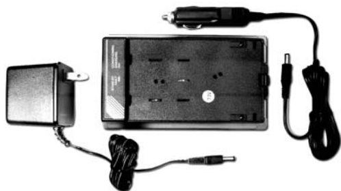
WPPN4002BR Shown With Optional Cigarette Lighter Adapter